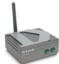
DP-G310 802.11g/2.4GHz Print Server