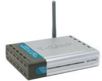
DWL-G700AP 802.11g/2.4GHz Wireless Access Point

The DWL-G700AP eliminates the need for a separate DHCP server on the network. When enabled, the built-in DHCP server will automatically assign IP addresses to wireless clients.