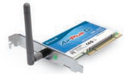
DWL-G510 802.11g/2.4GHz Wireless PCI Adapter

Other D-Link Products work with DWL-G700AP: