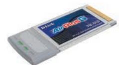
DWL-G630 802.11g/2.4GHz Wireless PCI Adapter